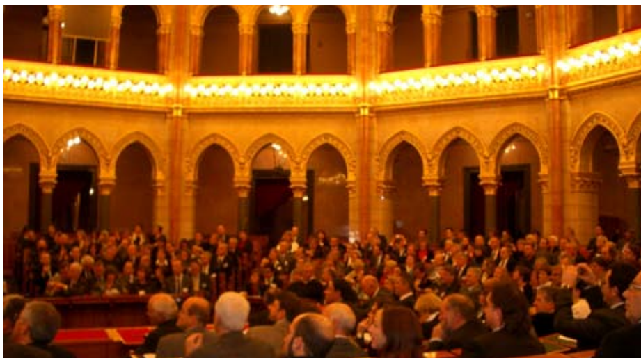
Hungarian Parliament building, European Quality Assurance Forum